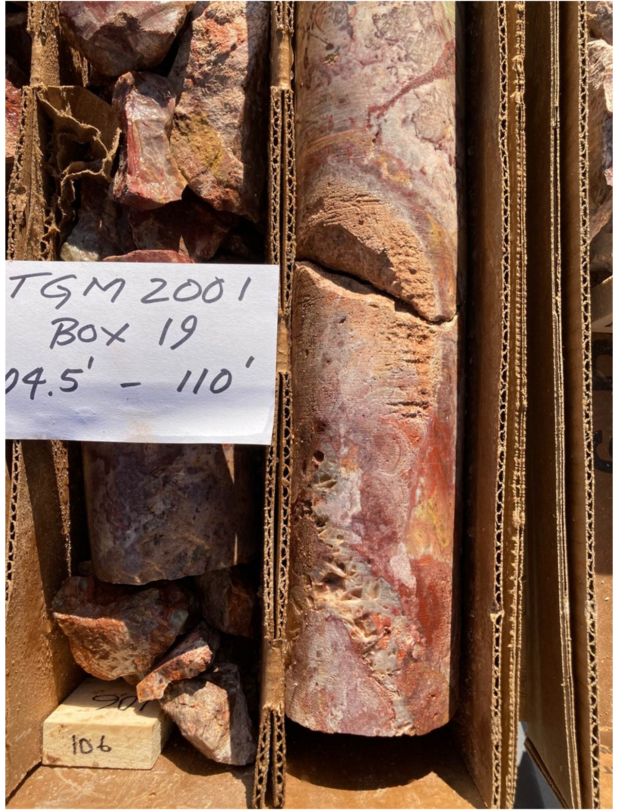
TGM 2001 – 85mm dia PQ core- Intensely silicified and oxidized tertiary volcanic with quartz veining