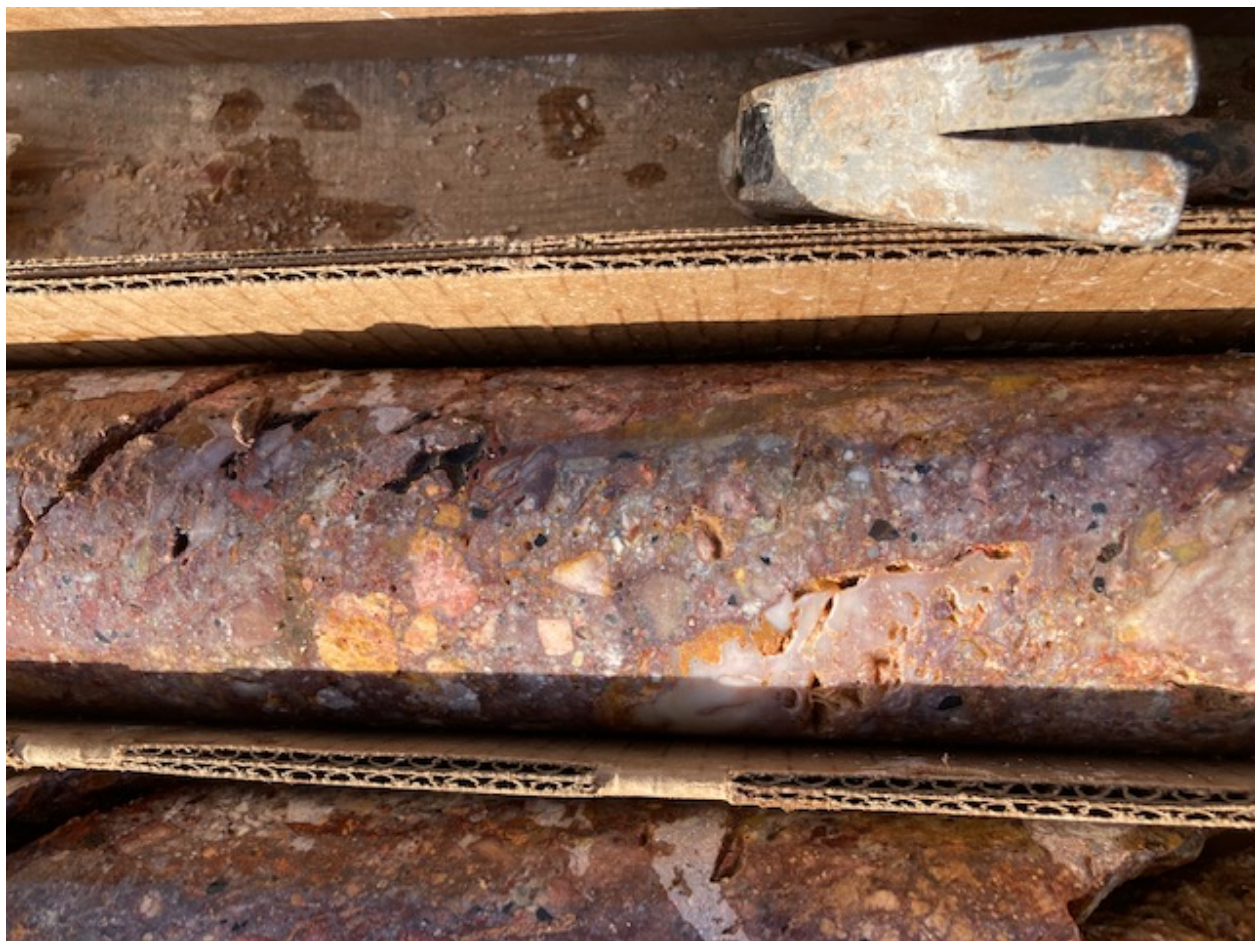
TGM 2003 Silicified and brecciated tertiary volcanic

Core sample captured in this program is intended to be utilized to conduct additional bottle roll and column leach gold and silver recovery testwork, as well as to perform crushing and stacking stability tests in preparation for Feasibility Study. Crushing tests utilizing high pressure grinding rolls are planned to determine if gold and silver recovery may be further optimized. Additional sample will also be used to perform environmental rock characterization testwork required for project permitting activities.